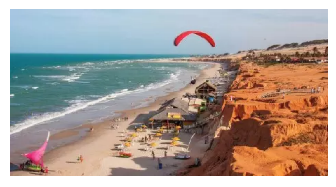
Coastline of the city of Canoa Quebrada.

In August 2023, the Brazilian Agency for International Tourism Promotion (Embratur) chose Ceará as one of the main locations to be promoted internationally, taking part in promotional campaigns in the United States, Europe and Latin America. The main reason for this was the variety of activities available that extend beyond sun and beach experiences, as well as the gastronomic delights found in various culinary hubs throughout the state of Ceará