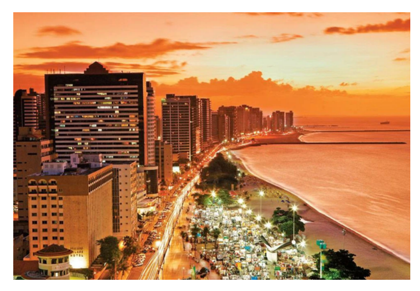
"A Praia de Meireles que se acende" by Alex Uchoa. Source: Viagem e Turismo.

Tourism also grew by approximately 4% in April when compared to March, which is above the Brazilian average. It is a sector of significant importance for the local economy and has attracted numerous tourists to various regions of the state of Ceará, maintaining a positive economic scenario and enhancing the country's prominence.